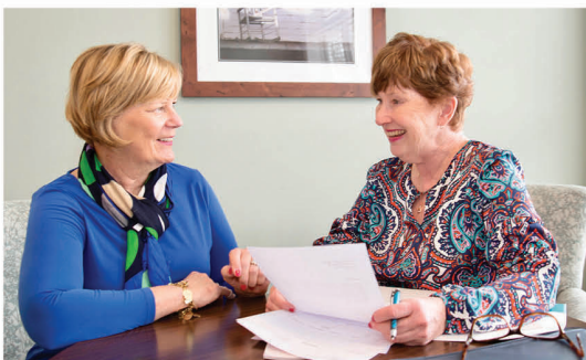
Care Management Services include a Personal Consultation