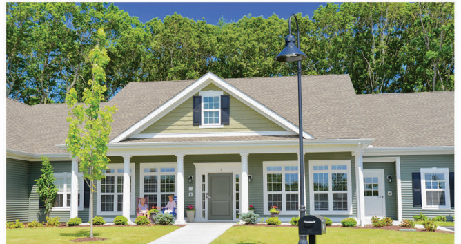
One of four GREEN HOUSE® Homes now open in East Greenwich.